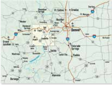
10th Mountain Hut System is in central Colorado between Crested Butte, Aspen, Vail, Breckenridge, and Winter Park.