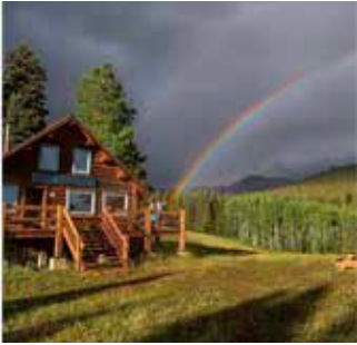
Harry Gates Hut